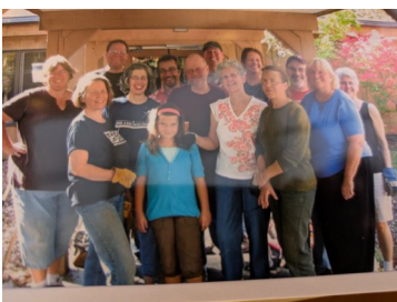
Blast from the Past