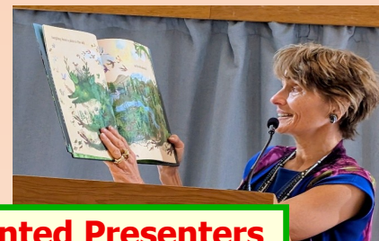
Talented Presenters this year!