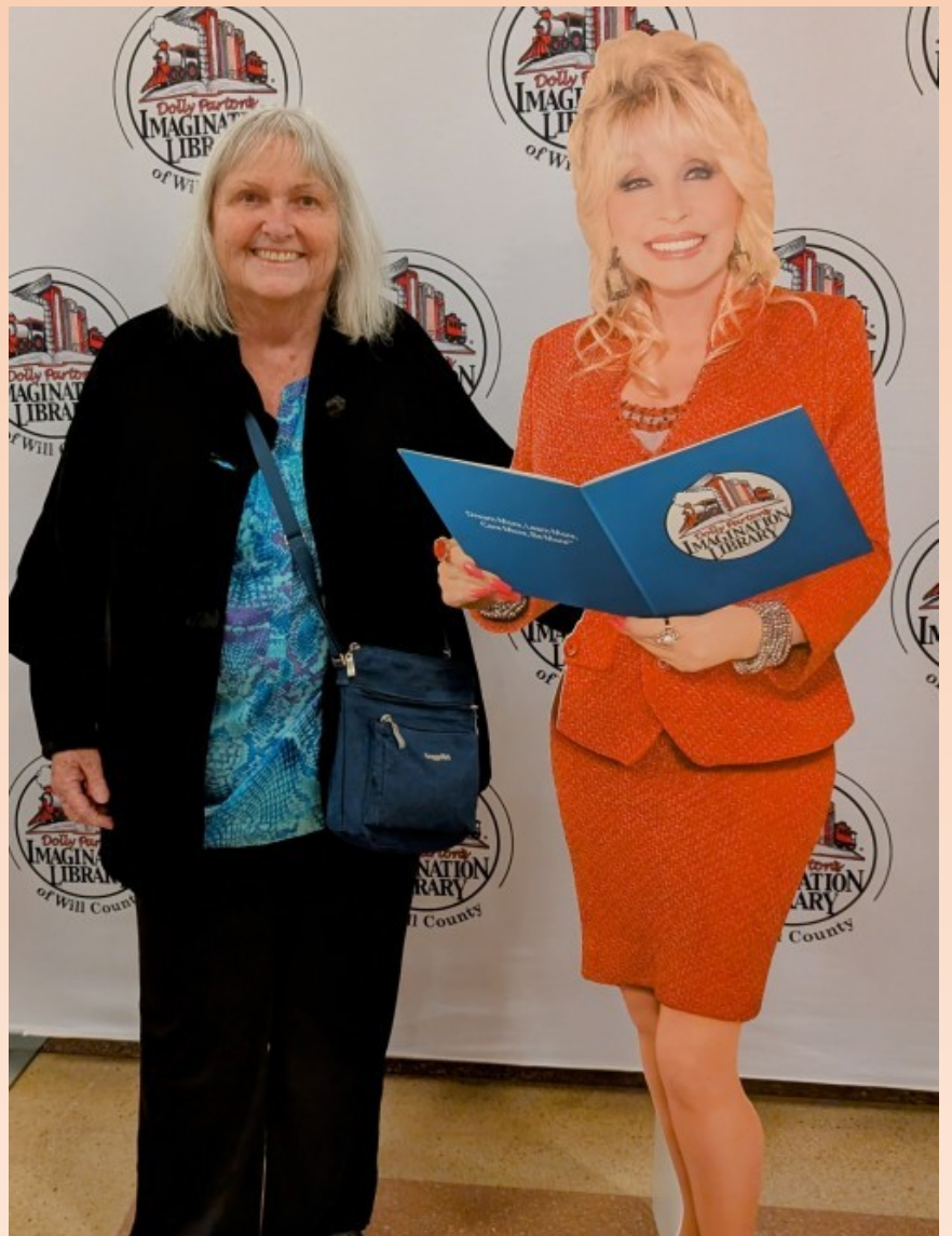
Photo of me and a cutout of Dolly Parton at the Rialto Theatre. I went for a 9 to 5 screening at the Rialto which was a fundraiser for Dolly Parton's Literacy program in Will county. She gives books to schools.